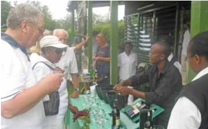
"Nederburg wine tasting"